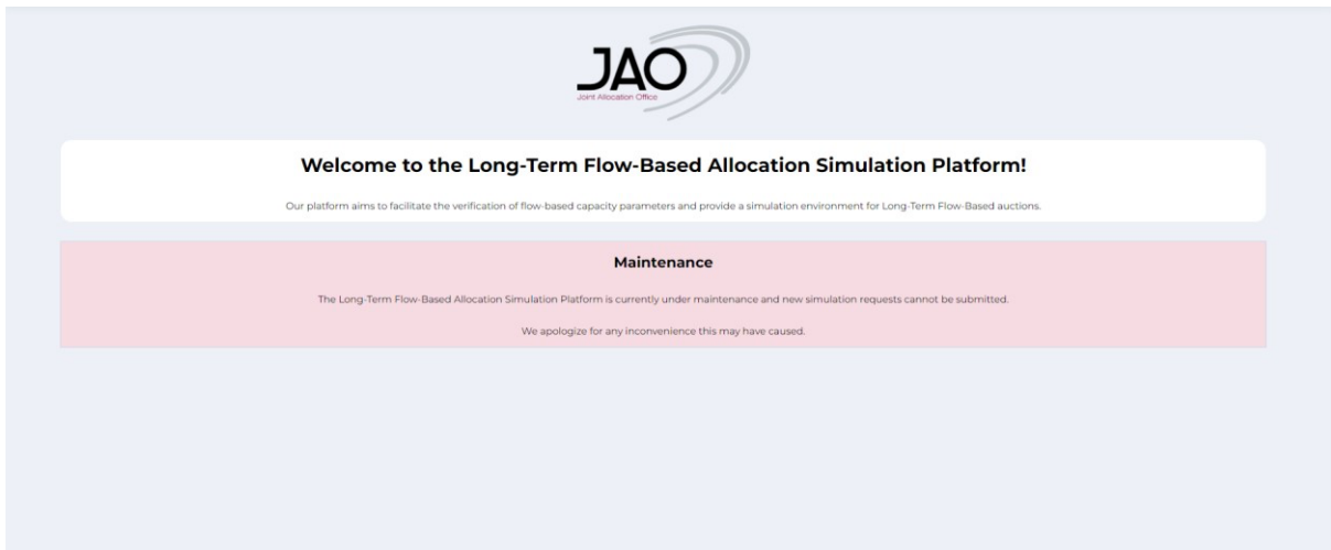
Figure 3 LTFBA Simulation Platform home page while in maintenance mode

In case Simulation Platform is in maintenance mode, associated warning message will be present on the home page indicating that user is not able to create any new simulations.